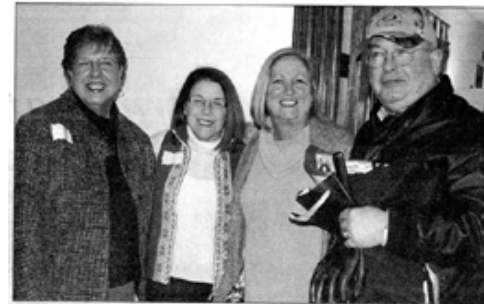
Members of Ascension, Epiphany and St. Alban's and Safe Harbor staff gather to share barbecue and to discuss ministry opportunities at Safe Harbor Rescue Mission. More than 95 from the three parishes attended and more than 50 signed up.