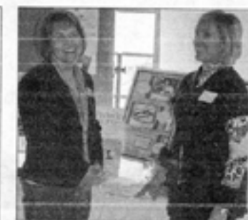
We Epiphany folks are apparently camera-shy...