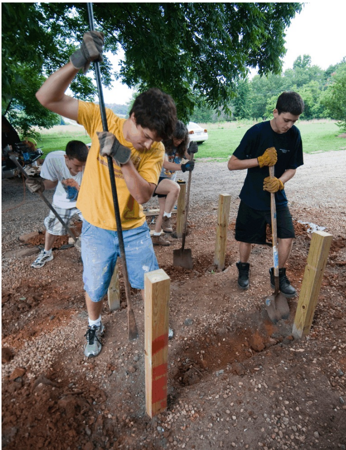
Left: Workcamp volunteers build a wheelchair ramp for a Conover stroke victim.

Our area has been blessed by the visit from these remarkable students, their giving hearts, and the program that brought them to us.