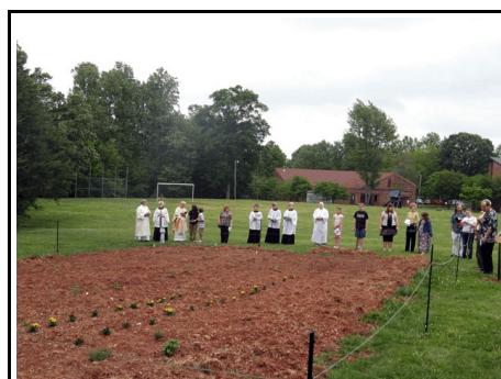
Gathered for the blessing