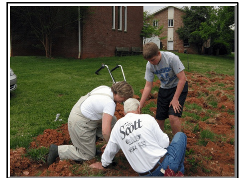
Farmers at work