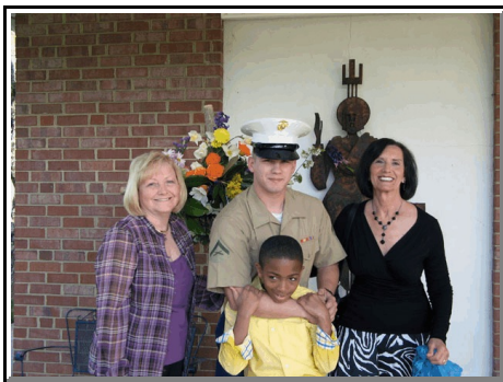
Happy Easter group with the flowered Cross