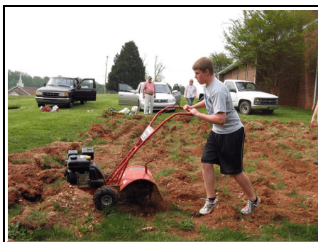
Thomas the Tiller