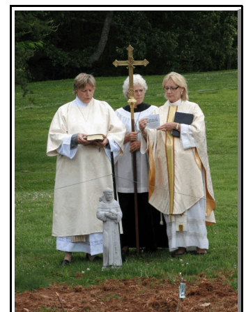
Blessing the garden