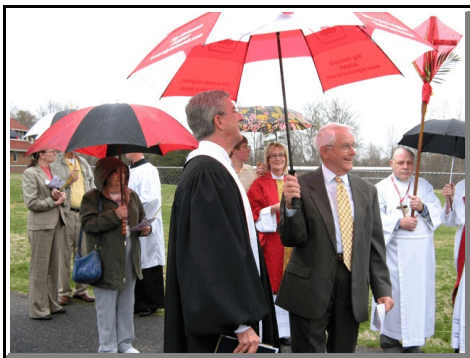
Palm Sunday Blessing of the Palms